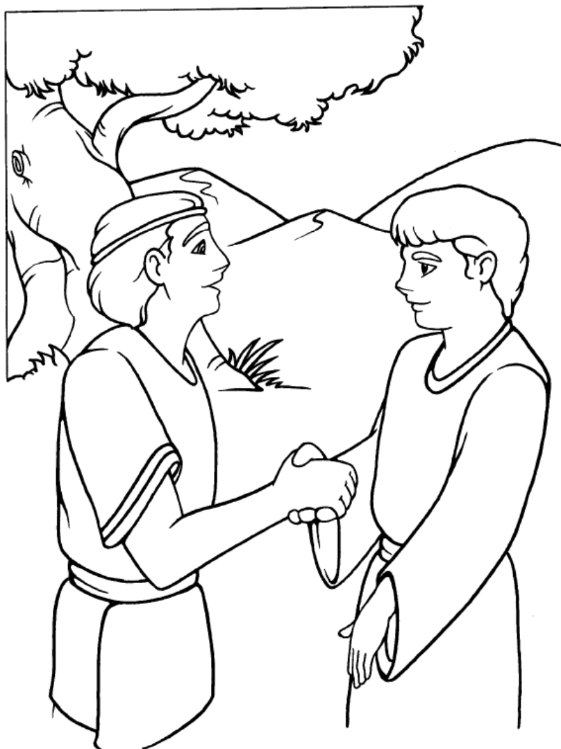
Esau Sells His Birthright to Jacob Genesis 25:19-34

Copyright © CalvaryCurriculum.com Used by Permission