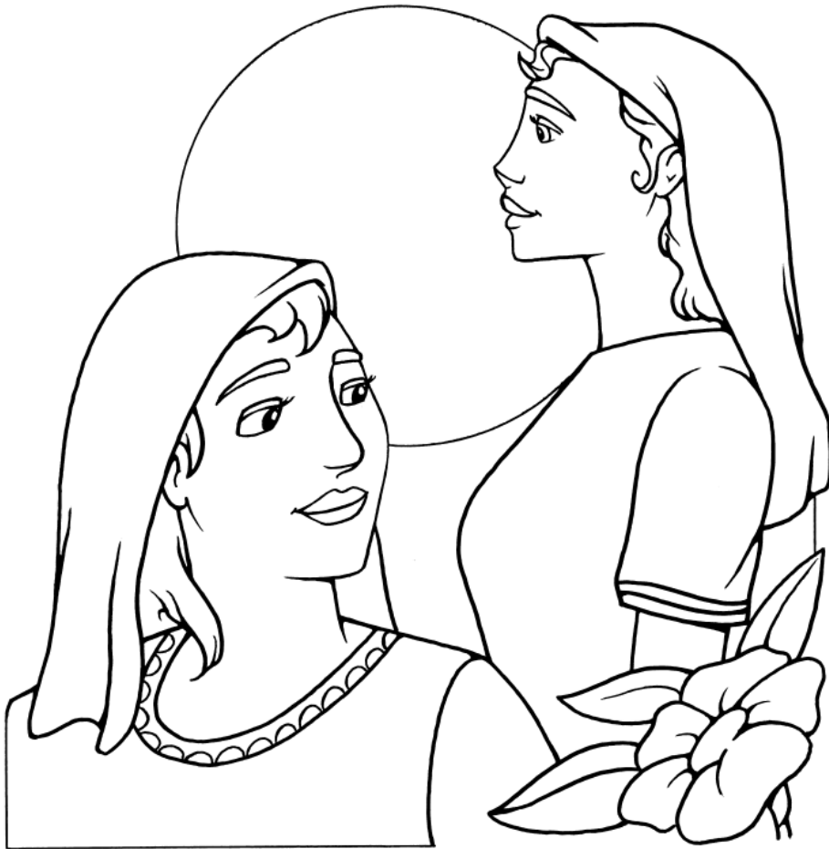
Leah and Rachel

Now Laban had two daughters; the name of the older was Leah, and the name of the younger was Rachel.