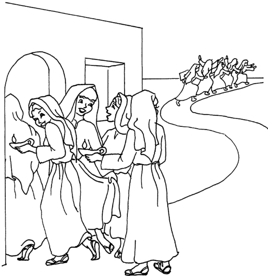
The Parable of the Ten Bridesmaids Matthew 25:1-13