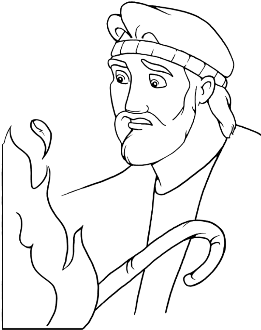
Moses and the Burning Bush Exodus 3:1-15